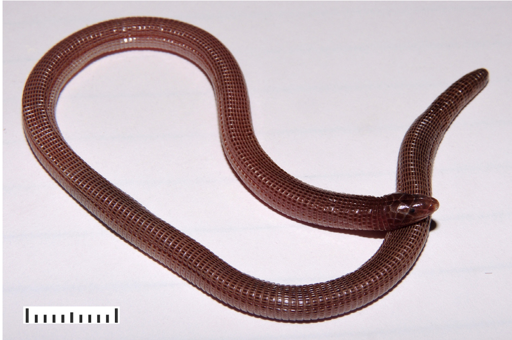
Figure 2. Amphisbaena barbouri from Cayo Galindo, the first offshore record of the species. Scale bar in millimeters.

Other new locality records from this work are indicated by numbers in Fig. 1. MAYABEQUE Province. Santa Cruz del Norte Municipality: (1) Peñón del Fraile (23.1487, -81.8650) and (2) Loma de Canasí (23.1443, -81.7735). MATANZAS Province. Varadero Municipality: (3) "Varahicacos" Protected Landscape (23.1961, -81.1552).